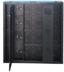
Tensile aluminum cabinet 1